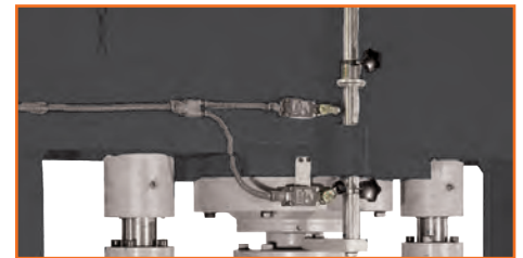
Stroke adjustment by limit switch