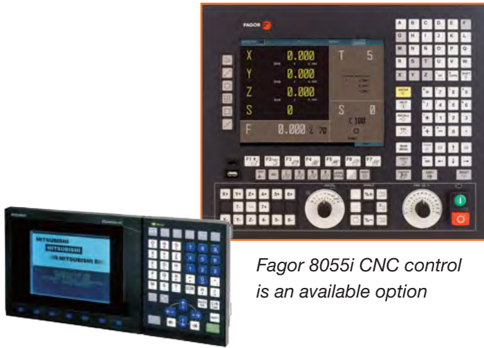
Fagor 8055i CNC control is an available option

Mitsubishi CNC control system is standard for CNC machines