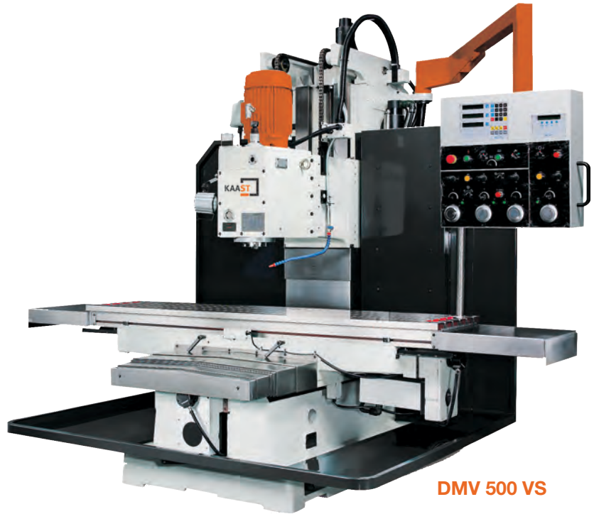
DMV 500 VS