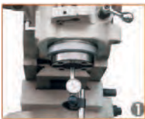
Rotary of inner spindle taper