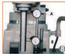
Rotary of spindle