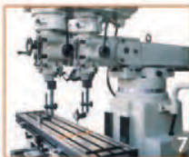
Parallelism traverse/table surface