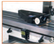
Squareness column/table horizontal