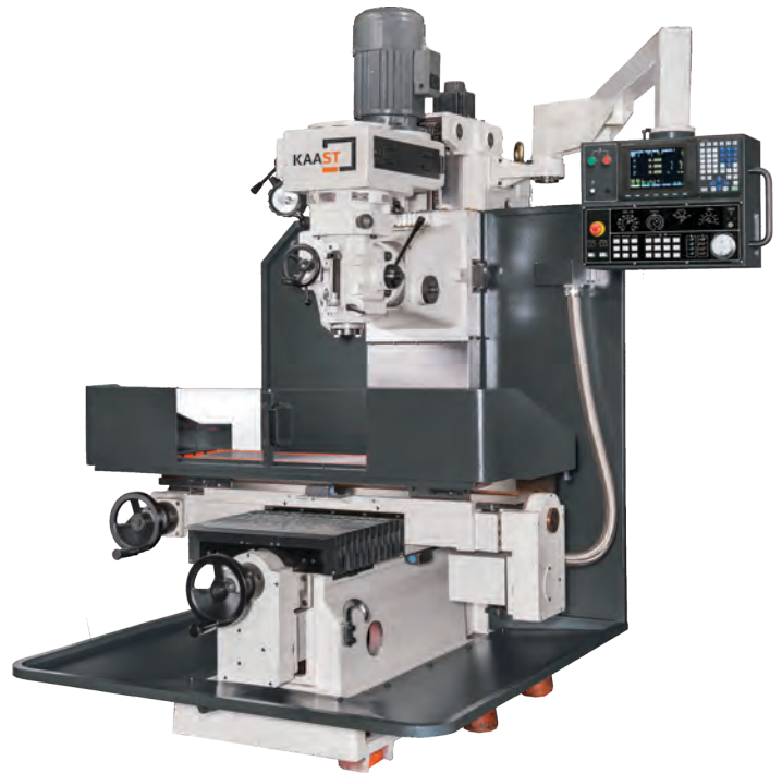
DMV 380 VS CNC

Mitsubishi CNC control system is standard for CNC machines