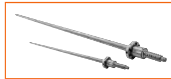
Precision ballscrews are used on X&Y axes. (CNC)

Hi/Low speed gear drive spindle for powerful cutting performance (CNC)