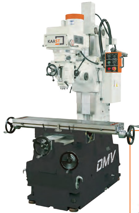
DMV 250 B

3-axis digital readout (DRO) is included