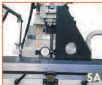
Squareness column/table vertical