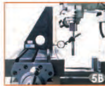
Squareness column/table vertical