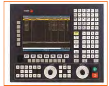
Fagor 8055i/A TC Control