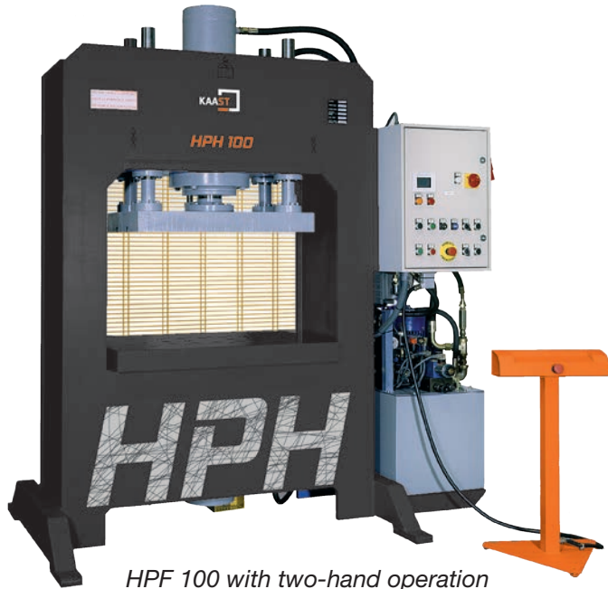
HPF 100 with two-hand operation

Hydraulic press for bending, punching and compression molding