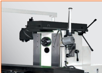
H-Mill 1300 (1500)