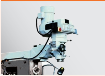
H-Mill 1500 T