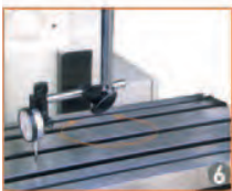
Parallelism traverse/table surface