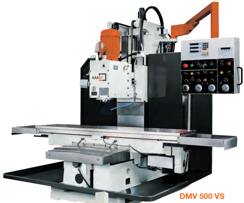
DMV 500 VS